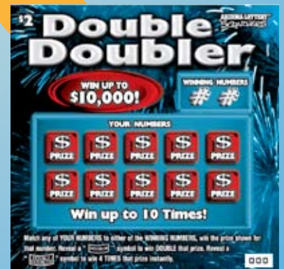
#591 Double Doubler $2