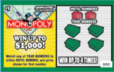
#604 Monopoly $1