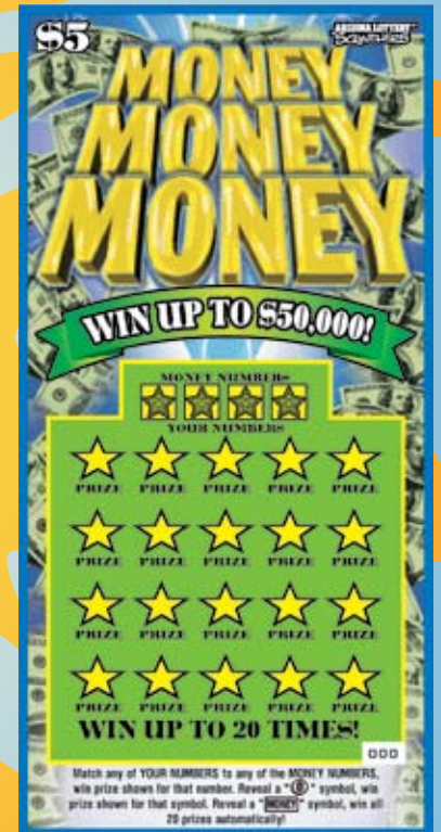
#599 Money Money Money $5