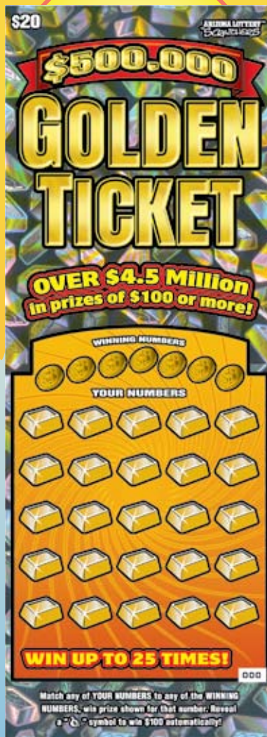
#607 $500,000 Golden Ticket $20