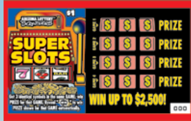
#545 Super Slots $1