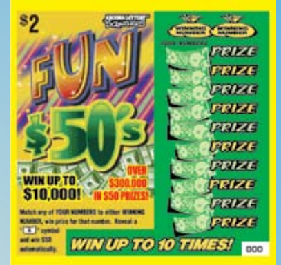
#595 Fun 50's $2