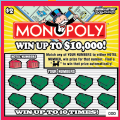
#605 Monopoly $2