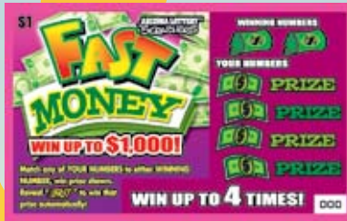
#614 Fast Money $1