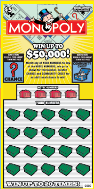
#606 Monopoly $5