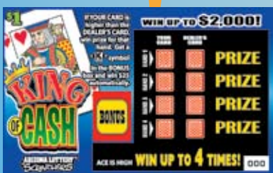
#608 King of Cash $1